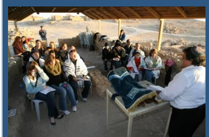
Figure 2 – AO Families at Masada, Israel