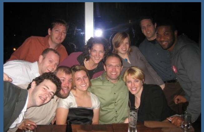
Dinner at Shout.