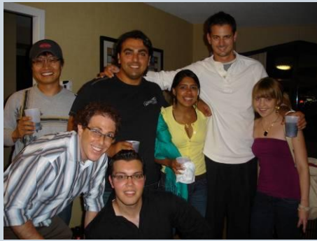
Students from Manitoba, Toronto, Detroit, LA, Buffalo, and Birmingham