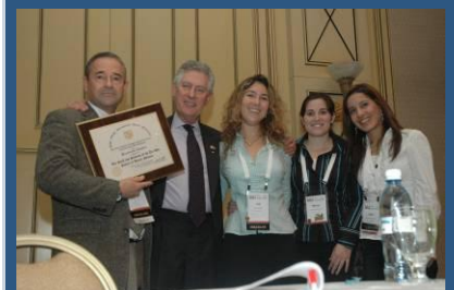
Figure 3 – Presentation to Tel Aviv University School of Dentistry