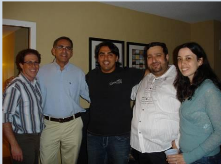
Israeli students and faculty