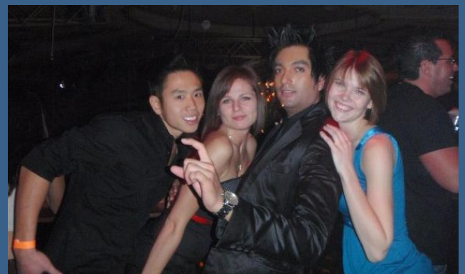
Students out on the town in Atlanta.