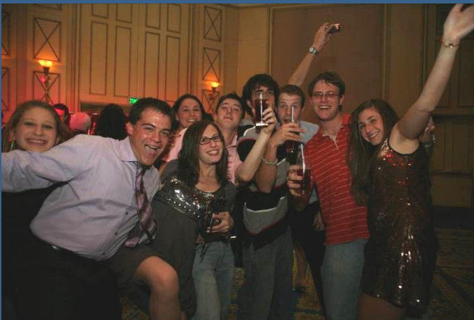
Figure 1 – New Year's Eve - Tel Aviv 2007 Convention