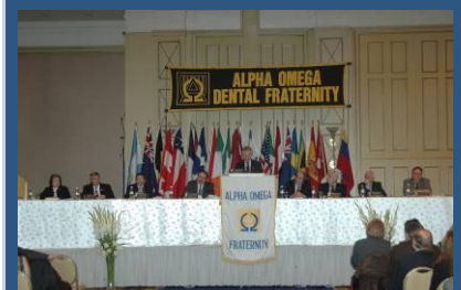
Figure 4 – International Council Meeting 2007