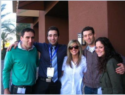
Students tour the Arizona School of Dentistry and Oral Health in Mesa, AZ