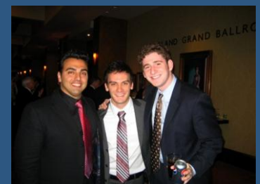
Former SFRs and ISR at Honors Night