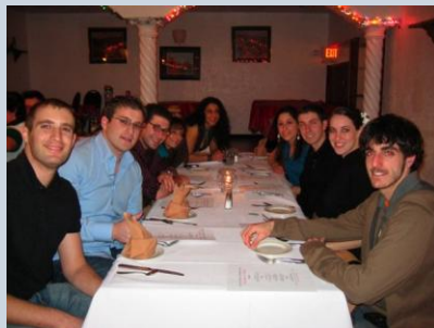
Student night out at a local Salsa Dancing Restaurant