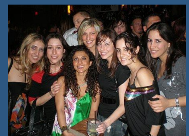
AO girls hit up the clubs in downtown Scottsdale