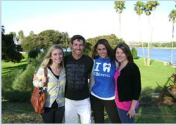
Exploring Pacific Beach