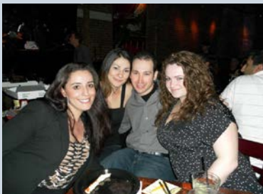
Student Night Out