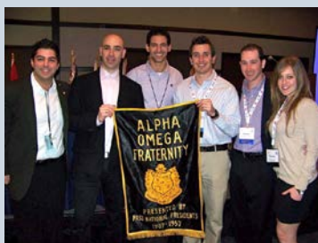
Incoming and Outgoing Student Leaders