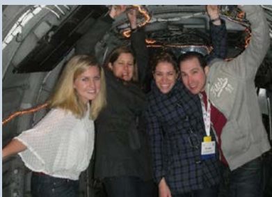
USS Midway Tour