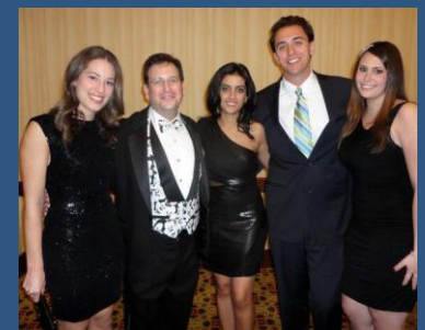
Students enjoying an honors night

Overall, I was overwhelmed by how welcoming everyone was and how I immediately felt like a part of the international AO family.