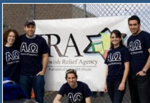
Chapter members volunteering for the Jewish Relief Agency

I am happy to share any information on our efforts with other student chapters.