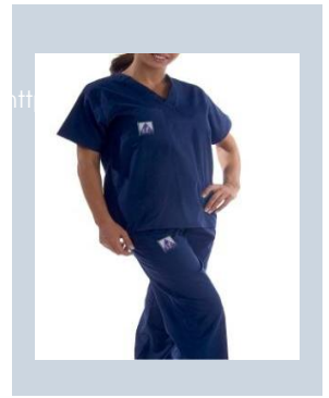
AO Scrubs (design may vary)

Alpha Omegas around the world are constantly contributing their time and finances to worthwhile causes. Community service is an integral part of what makes Alpha Omega great; keeping consistent with AO's Global Oral Health Initiative - reducing the debilitating nature of dental disease facing those in need, worldwide. This year, as an effort to have Alpha Omegas recognized while performing community service, the students are continuing the international scrub sale. We would like these scrubs to act as a uniform so that those being helped by Alpha Omegas can immediately acknowledge the presence of such a great organization.