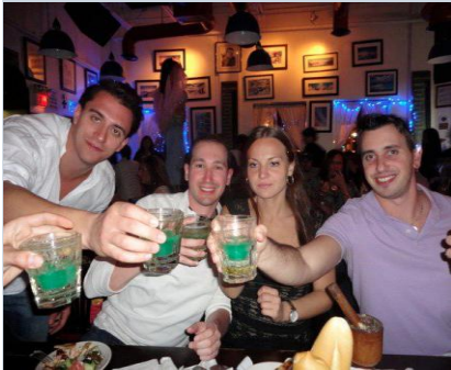
Students night out in Tampa