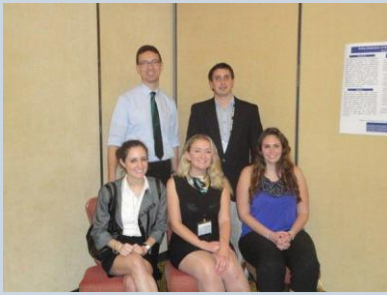
2011 Poster Competition