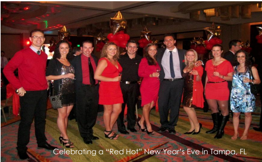
Celebrating a "Red Hot" New Year's Eve in Tampa, FL