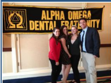
2012 ISRs visit Boston